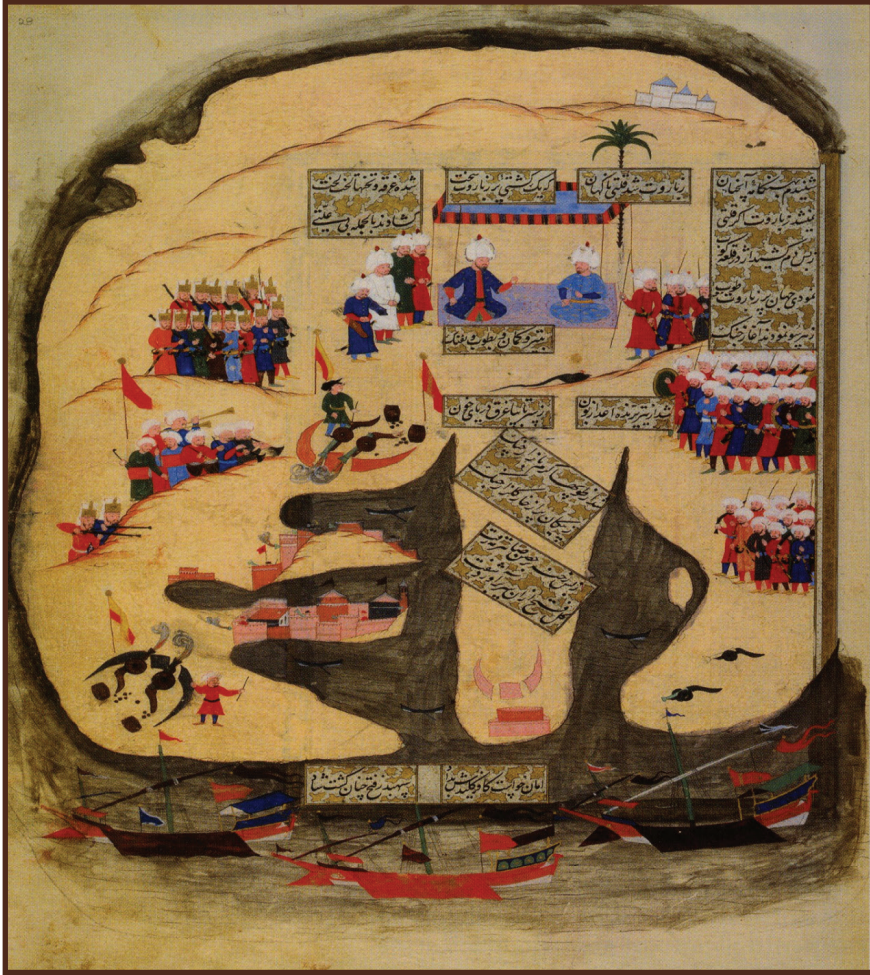
The fourth model: Siege of Malta & Manuscript History of Sultan Suleyman & 978AH. 1579AD. & Dublin T413

enemy with strange sounds like the thunder that is heard from afar and then slowly, thus ending the war in the shortest time and preventing - to some extent - without bloodshed. The six main instruments are played by blowing and four by clicking. The music team advanced the ranks of the army with hundreds of machines blowing and clicking, such as drums, wolves, brass discs, flutes, trumpets, etc., and special tunes and hymns were put in place to motivate the soldiers.