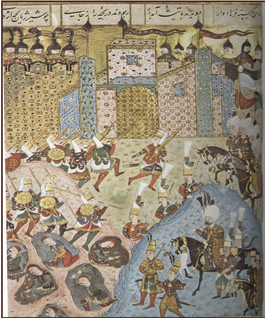
The seventh model: The siege of Rhodes & Manuscript of Suleymannama & 965AH. 1558AD. & Topkapi museum H1517