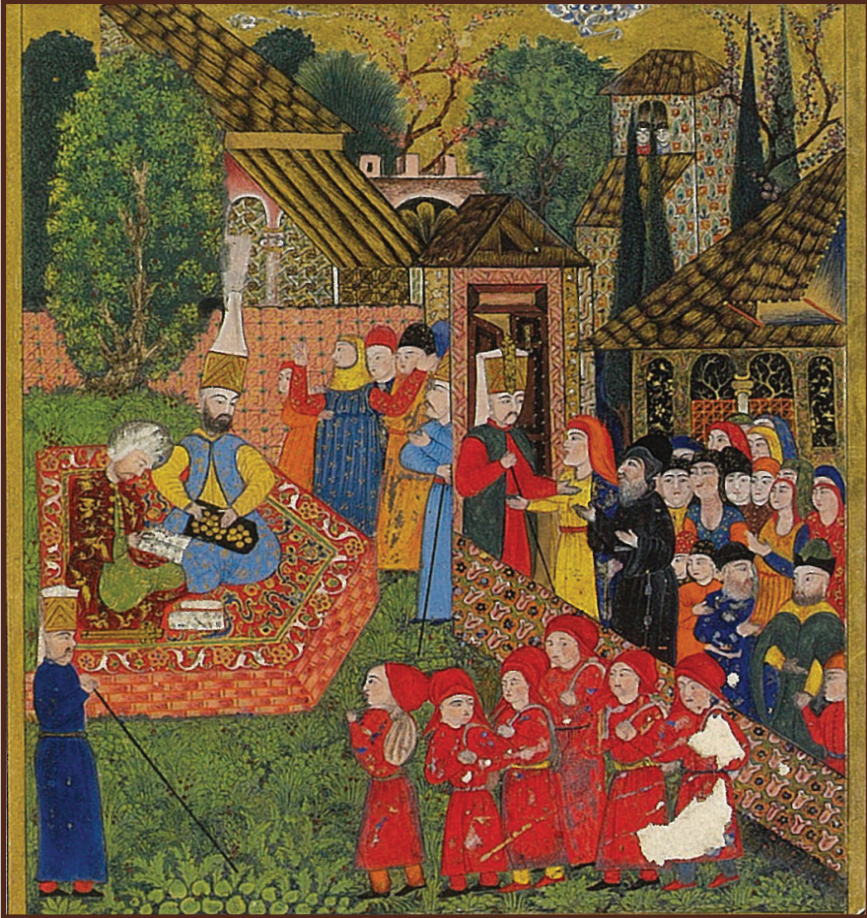
The third model: Recruitment of children”Devshyrymaa” & Manuscript of Suleymannama & 965AH. 1558AD. & Topkapi museum H1517