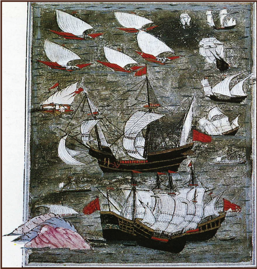
The sixth model: Ottoman naval fleet & Manuscript of History of sultan Baeyzed 947AH. 1540AD. & Topkapi museum H642