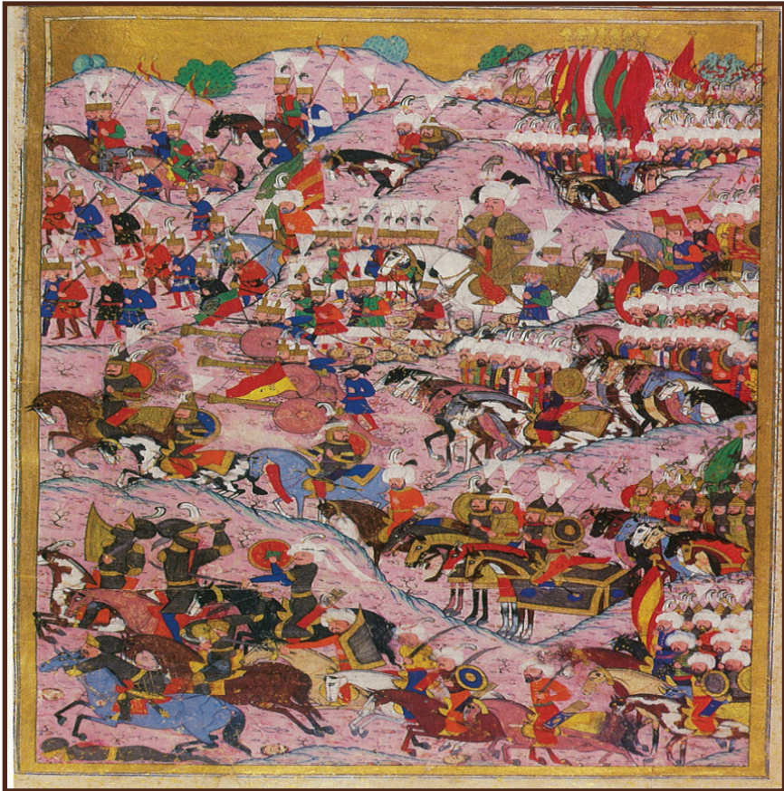
The fifth model: War of Mohax & Manuscript of Hunornamaa p.2 & 996AH. 1588AD. & Topkapi museum H1524