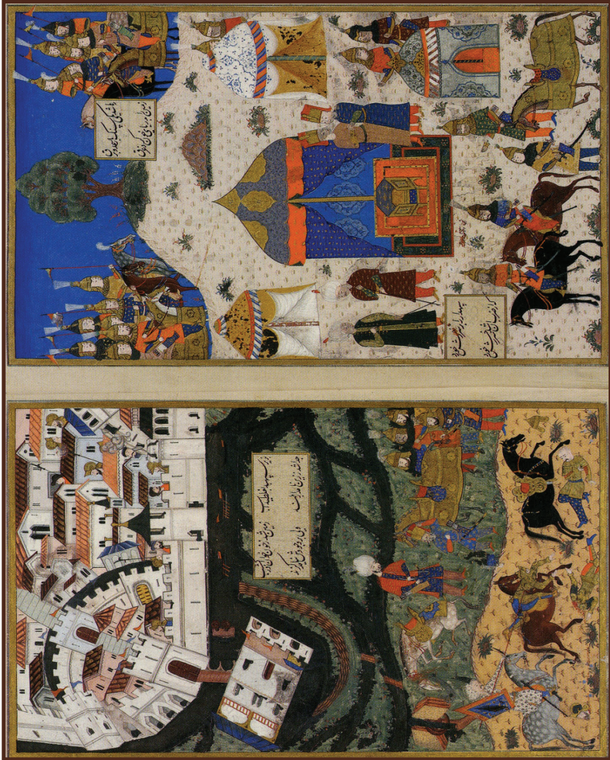
The first model: The siege of Tamisfar city & Manuscript of Ftuhat Jamela & 964AH.1557AD. & Library of the University of Istanbul T5964